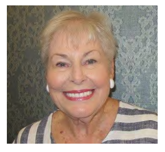
Apologies from our on-site photographer. Barbara Gardener was in attendance but was not included in the photograph.

An extract from Wendell's book, reprinted here With Wendell's permission.