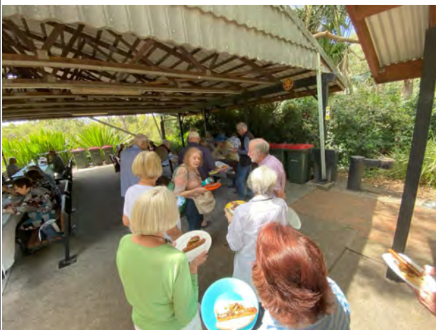
And still they queue