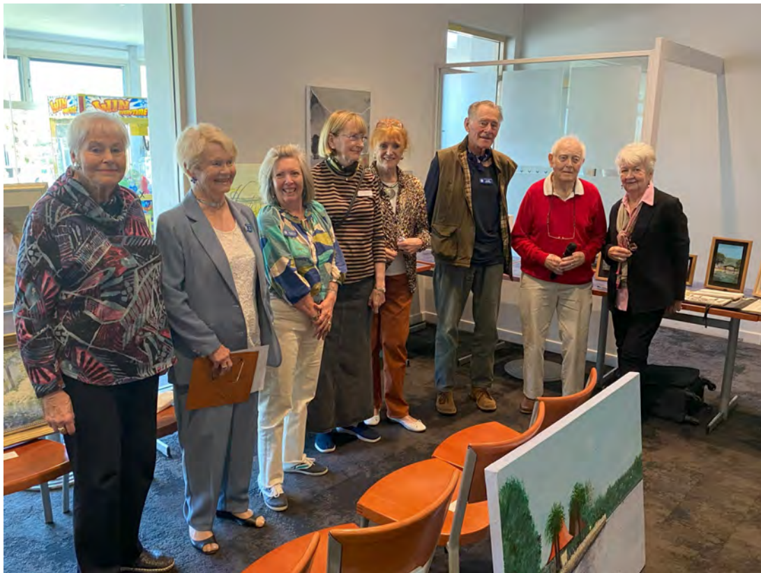
Our Amazing Artists

I have a number of photos taken on the day, too many to include in the Newsletter, so I'm planning to get them uploaded into our Website. We are having a few issues at the moment but I'm hoping it won't be too long before can load them up. I will advise when they are in place