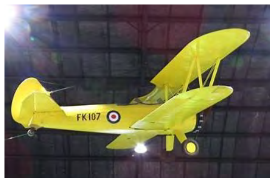
It'll never land in here!