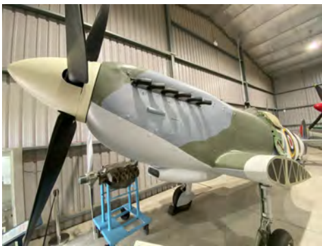
Even I can tell this will never fly

A wonderful days outing, I think all those who attended would agree.